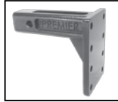
165 /166 Receiver (pg 69)

One of Premier's most unique and versatile couplings is our very popular model 150 Combination Coupling. Whether you need to pull a trailer with an eye or ball connection, the 150 can do the job. Our patented side-swinging latch helps prevent tailgate damage and keeps the profile compact.