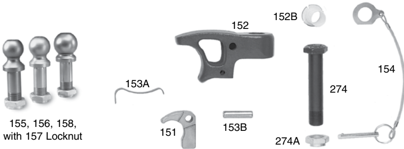
155, 156, 158, with 157 Locknut