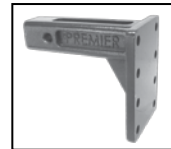
165 / 166 Receiver (pg 69)

The same unique latching as our model 150 (page 28), the model 160 offers a compact profile for tight places. Ideal for dolly haul back and other light to medium duty applications.