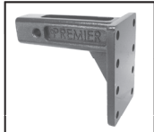
165 / 166 Receiver (pg 78)

The same unique latching as our model 150, the model 160 offers a compact profile for tight places. Ideal for dolly haul back and other light to medium duty applications.